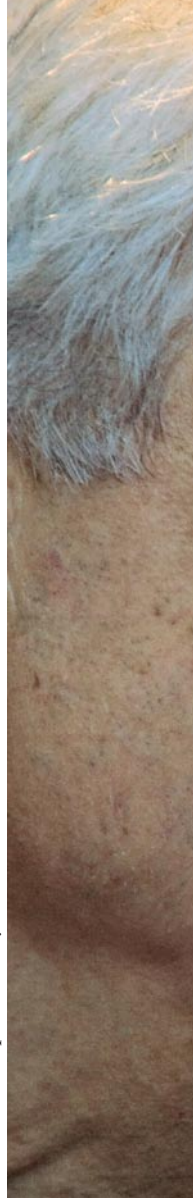
From I Still Do , published by Powerhouse Books