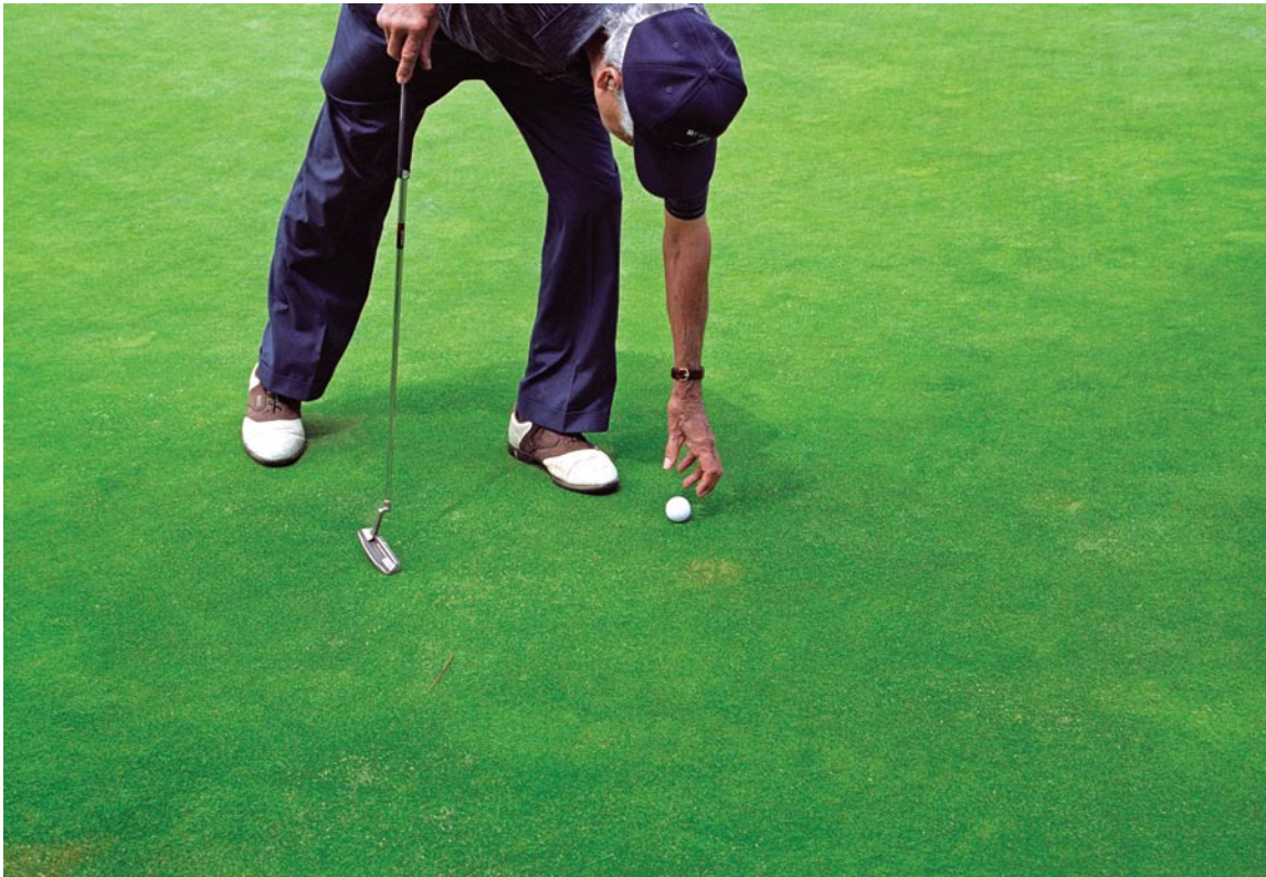
From I Still Do , published by Powerhouse Books