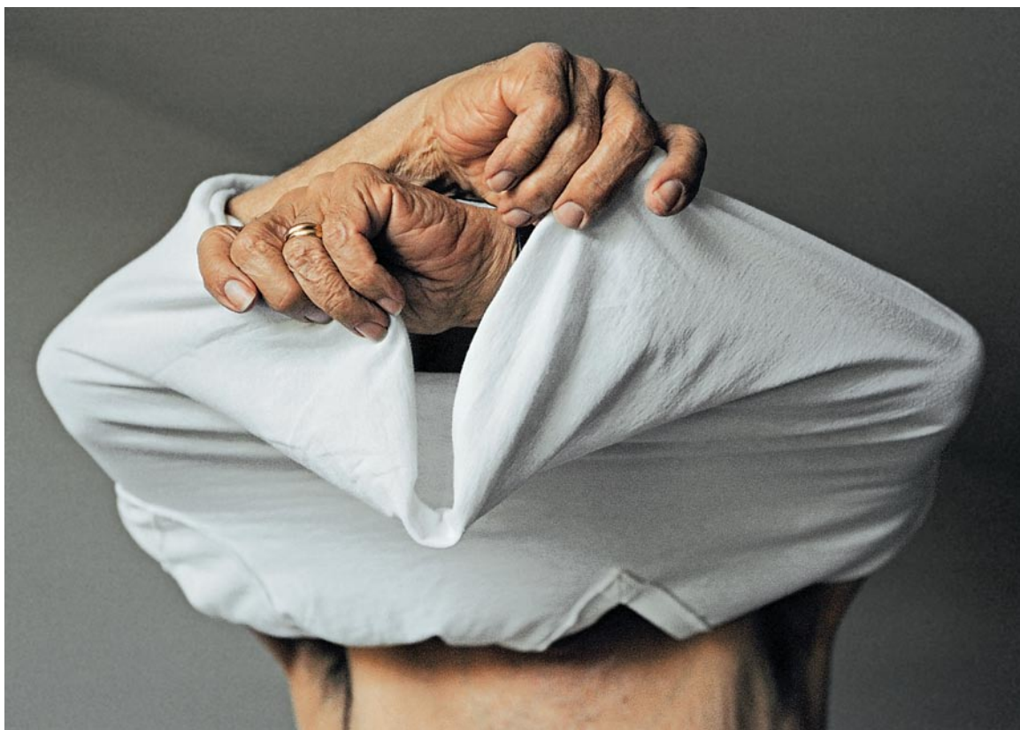
From I Still Do , published by Powerhouse Books